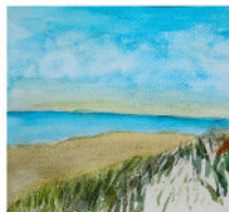
INDIANA DUNES NATIONAL PARK

G uadalupe Mountains National Park is located in the northern part of Texas. It was established in 1922. The park is known for its colorful mountains and fossils.