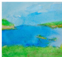
VIRGIN ISLANDS NATIONAL PARK

M esa Verde is a national park in Colorado. It is known for its ancient cliff dwellings and rock art.