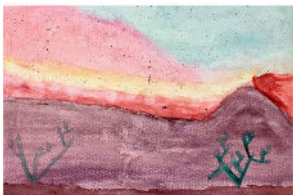
GUADALUPE MOUNTAINS NATIONAL PARK

ack... range in... (The text is partially obscured and difficult to read.)